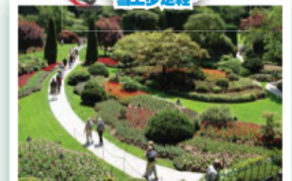
布查特花園 Butchart Gardens